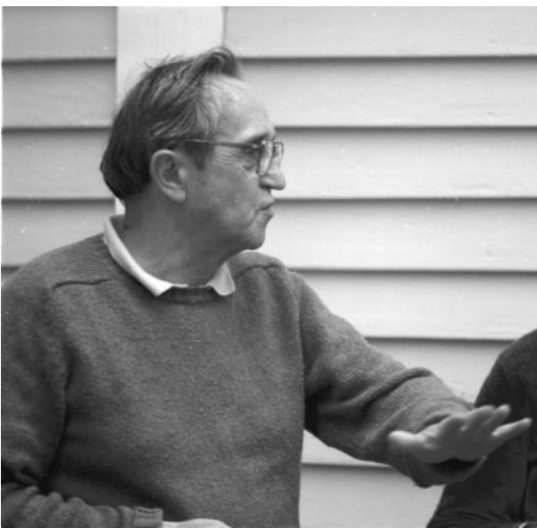
Fig. 1. Photograph of Ray Rappaport in 1989.

Although Ray never worked with a gene, protein, or antibody, he defined the rules for how the mitotic apparatus stimulates the cortex to form a furrow. He showed that the asters of the mitotic spindle are the source of this positive signal (at least in echinoderm eggs), measured the rate that the stimulus moves from the mitotic asters to the cortex, identified the time required for the stimulus to make a lasting impression on the cortex, and discovered a latent period between receipt of the signal and the formation of a visible